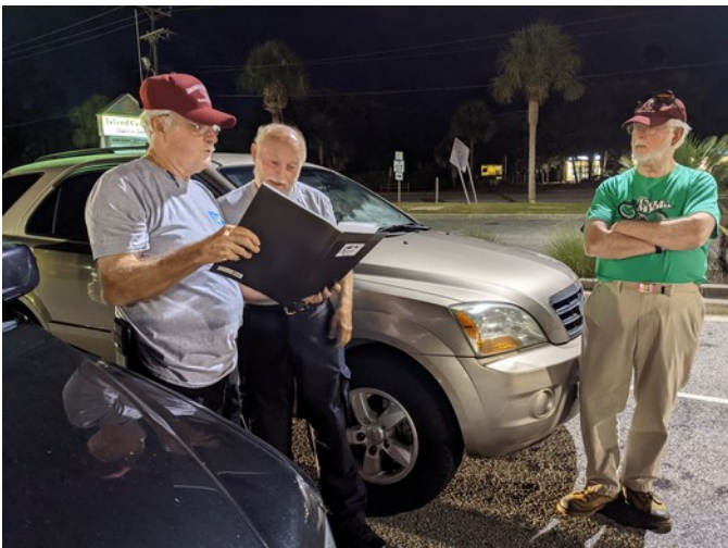
KY4BO, KJ4OXF, and KO4BPL review the IOP Run comms plan

The CARS trailer has been repositioned to Miles Road Baptist Church maintenance secured area. Trailer was cleaned inside and spare tire, pump, jack, lug wrench, numerous "D" rings attached for securing generators, gas cans, chocks, etc were installed.