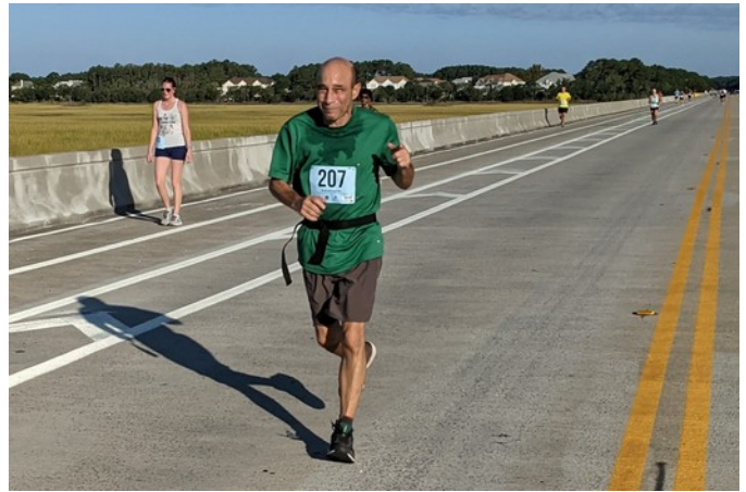
Club member AA2BB ran the IOP Connector

We are looking for hams to support the LowVELO bicycle ride on 6 November 2021. Some will man rest areas, and others will bring their radios along in the event vehicles. This is a good opportunity to test your go-kit.