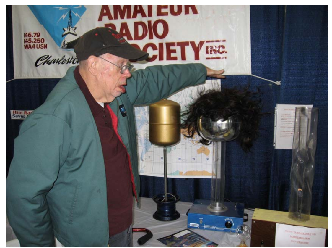
A hair raising experience at the Coastal Carolina Fair