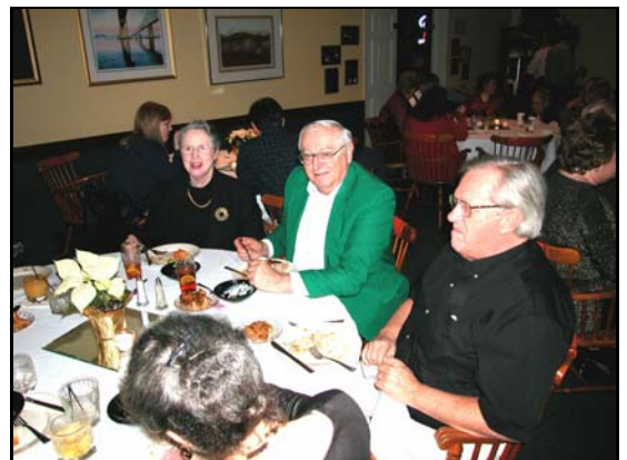
Christmas Party Pictures