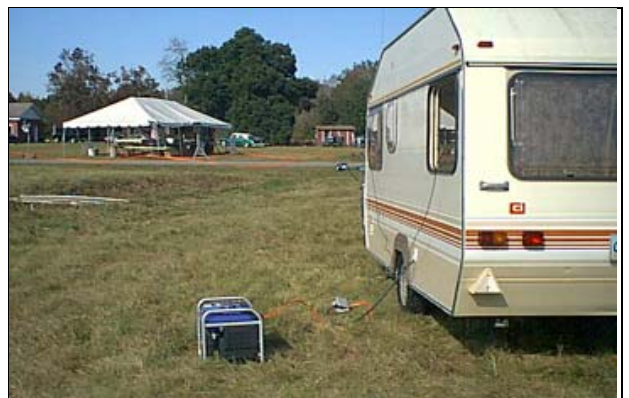
Festivello Bike Event Pictures